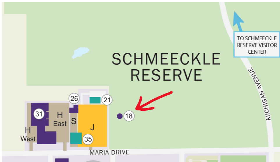
Figure 2. Map of Schmeckle showing the meeting location at Schmeckle pavilion, labeled number 18.